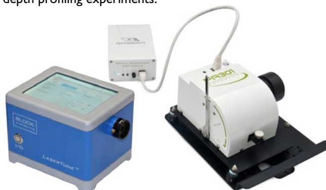
Fig 1. A PA301 photoacoustic detector (Gasera, Ltd) and a Laser-Tune EC-QCL source (Block Engineering, LLC).

EC-QCLs bring several advantages in photoacoustic detection against FTIR or dispersive spectrometers. First obvious advantage is the higher output power: EC-QCLs can provide over hundred mW of optical power with a narrow line width, while the blackbody IR source of an FTIR typically produces notably less than one mW per wavenumber on average. The maximal resolution of EC-QCLs varies from < 1 \text{ cm}^{-1} ,