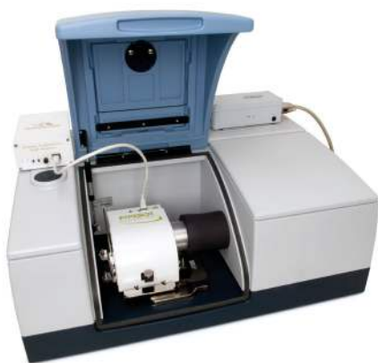
Fig. 2. PA301 installed as an external detector to the FTIR spectrometer.

12 hair samples from cocaine-overdose patients along with 12 reference hair samples from subjects with no cocaine abuse were measured with Gasera PA301 connected to Bruker Tensor 37 FTIR spectrometer. The measurement setup is shown in Fig. 2, and the parameters are presented in Table I. 20 – 30 mg of hair material was used per measurement to obtain a good average. Carbon black was used in the normalization of the spectra and helium was used as a carrier gas in the photoacoustic cell. Hair fibers consist mostly of keratin, which is a general name for fibrous proteins consisting of long amino acid chains, along with water, lipids, pigment and trace elements. The cocaine content in hair samples varied between 1.5 and 38 ng/mg.