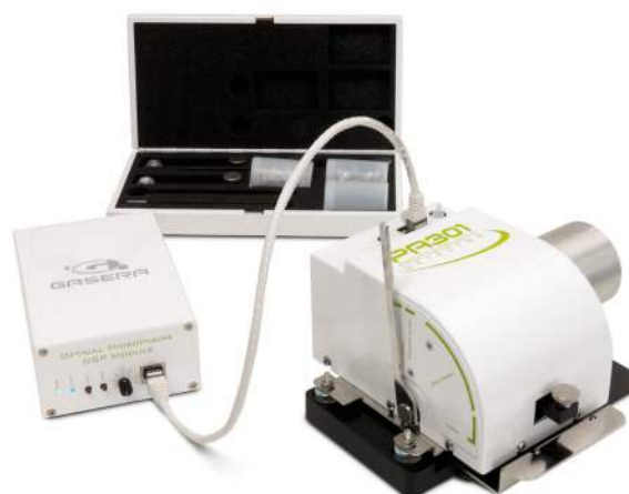
Fig. 1. PA301 and its accessory box

Hair is a problematic sample material for common infrared spectroscopic techniques. Lack of sensitivity and difficult sample preparation procedures of transmission-based