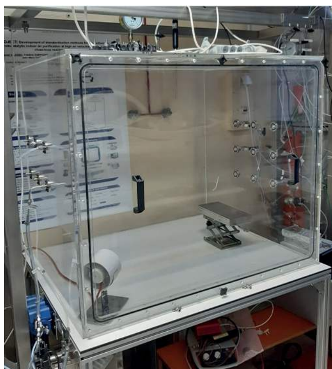
Figure 1: Test Chamber at IRCELYON

Formaldehyde HCHO is a volatile organic compound classified as irritant, carcinogenic and genotoxic. Its presence in indoor air at increasing rates is one of the major current concerns in terms of public health. In order to be able to assess the efficiency of air purification solutions, standardization tests have been set up at European level, using various equipment ranging from bench-top reactors to 40 m 3 rooms. In this context, the Lyon Institute for Researches on Catalysis and the Environment (IRCELYON, a joint CNRS and University Lyon 1 unit) has a 1 m 3 enclosure to simulate small enclosed spaces. Dedicated analytical systems make it possible to simultaneously quantify various target VOCs such as formaldehyde, acetaldehyde, acetone, toluene, etc. with a detection limit of around 10 ppbv. IRCELYON's research mainly focuses on devices using catalytic and photocatalytic purification techniques. IRCELYON has tested the GASERA ONE FORMALDEHYDE for the precise and selective measurement of Formaldehyde.